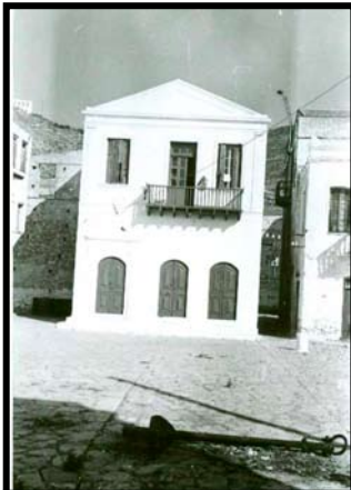
Kisthinos family home on Kastellorizo

So even though my father never himself lived in Kastellorizo he got the news from Kastellorizo! When I think about it now, it is amazing that his connection to this wonderful island was that strong and apparently he left this heritage to me since I'm now writing an article in a newsletter called "Kazzie News"!