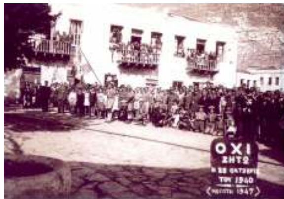
Oxi Day Celebrations, Kastellorizo, 1947.

If you can identify yourself or any other Kazzies please let the committee know.