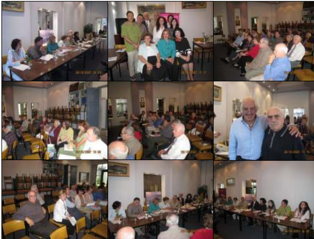
Photographs from the AGM held on Sunday 28 th of October 2007.

Advertisements coming soon All we need is you!