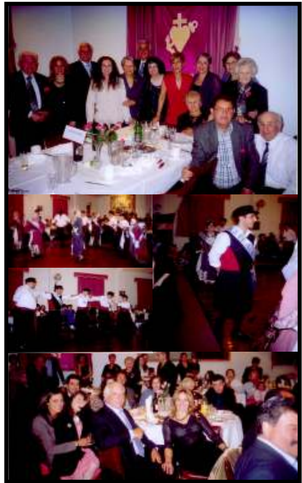
Top and bottom photos: The Kazzie contingency enjoying the evening. Middle photos: Traditional Greek Dance group dancing the many Greek dances during the evening.

On Sunday 6 th of October at the KOS club in Northcote, the Pan Dodecanese Association held a Glendi. In attendance were people representing each of the 13 islands that make up the Dodecanese group of Islands (see Greek Islands section on page 12). Approximately 250 people attended the function where they enjoyed authentic Greek food, listened to and watched authentic Greek music and dances. The Greek Banquet was supplied by Nikos Tavern of Ringwood. An enjoyable evening was had by all including the two tables of Kastellorizians that attended the function.