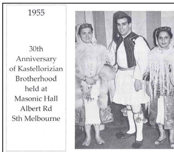
1955 30th Anniversary of Kastellorizian Brotherhood held at Masonic Hall Albert Rd Sth Melbourne

Despite the changing environment on Kastellorizo the one thing that remained constant was the Kastellorizian costume. It is unique to the Kastellorizo and was worn daily by most women on the island. With the introduction of modern clothing, the traditional dress was still worn on days of great celebrations, such as engagements and weddings. Traditional clothing was often worn when traveling to Athens and sometimes on migration. The Kastellorizians also had communities on the Turkish coast (Andifilo (Kas), Kalamaki (Kalkan)) and the women wore traditional dress on leaving Turkey during the exchange Greek-Turkish in the 1920's. The "Lady of Rho" was said to have worn traditional dress when she defied the Turks and hoisted the Greek flag on the flag pole on the small Kastellorizian island of Rho in 1945. Many Kastellorizian ladies wore this form of clothing in their new homelands. In many post-migration "official" family photographs, the Kastellorizian women are often pictured wearing the costume (see photograph* below).