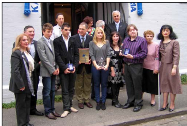
The Committee of the Kastellorizian Association of Victoria and the award recipients outside the clubrooms