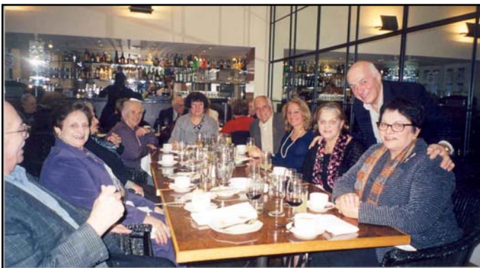
Photographs from the Kastellorizian Senior's Association luncheon that was that was held on May the 7 th at Vibes Savoy.

On May 7th the seniors celebrated Mothers' Day at the Vibes Savoy. We had an enjoyable lunch and 43 members attended.