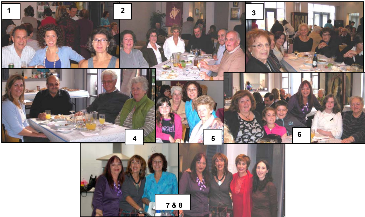
Megisti Ouzeri April 13 th . Photographs Top left to right: