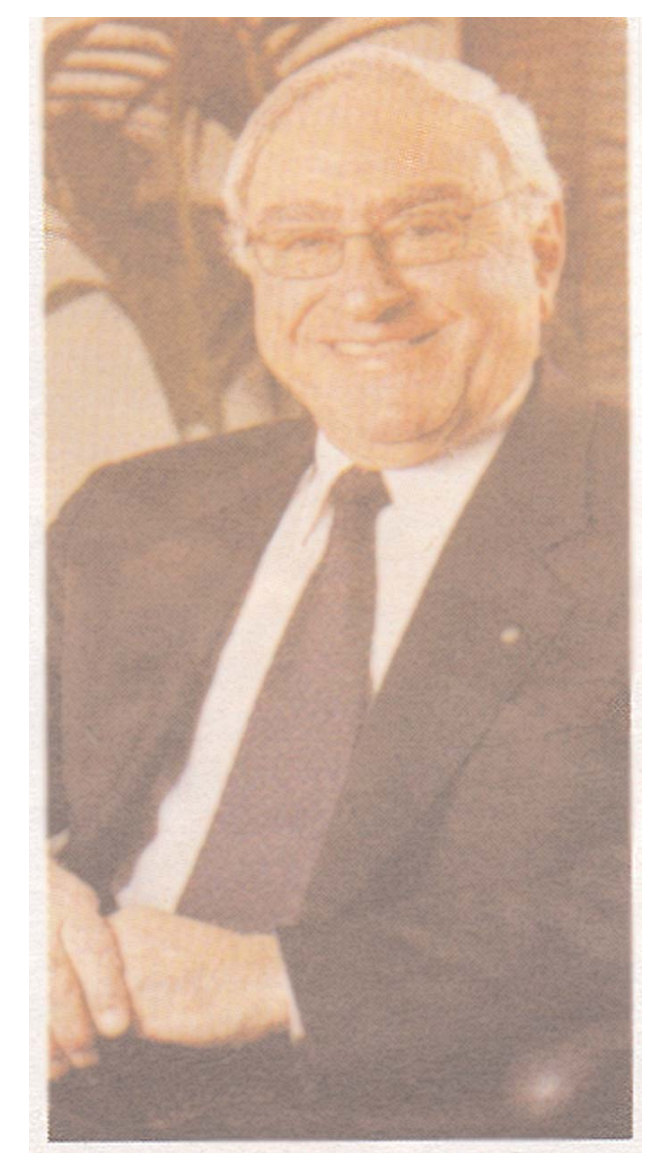
He was given membership of the General Division of the Order of Australia in 1996 for public service and services to engineering.

He completed a Bachelor of Engineering with firstclass honours in Civil Engineering in 1961, before continuing his studies at Imperial College in London, and later getting a PhD from the University of London.