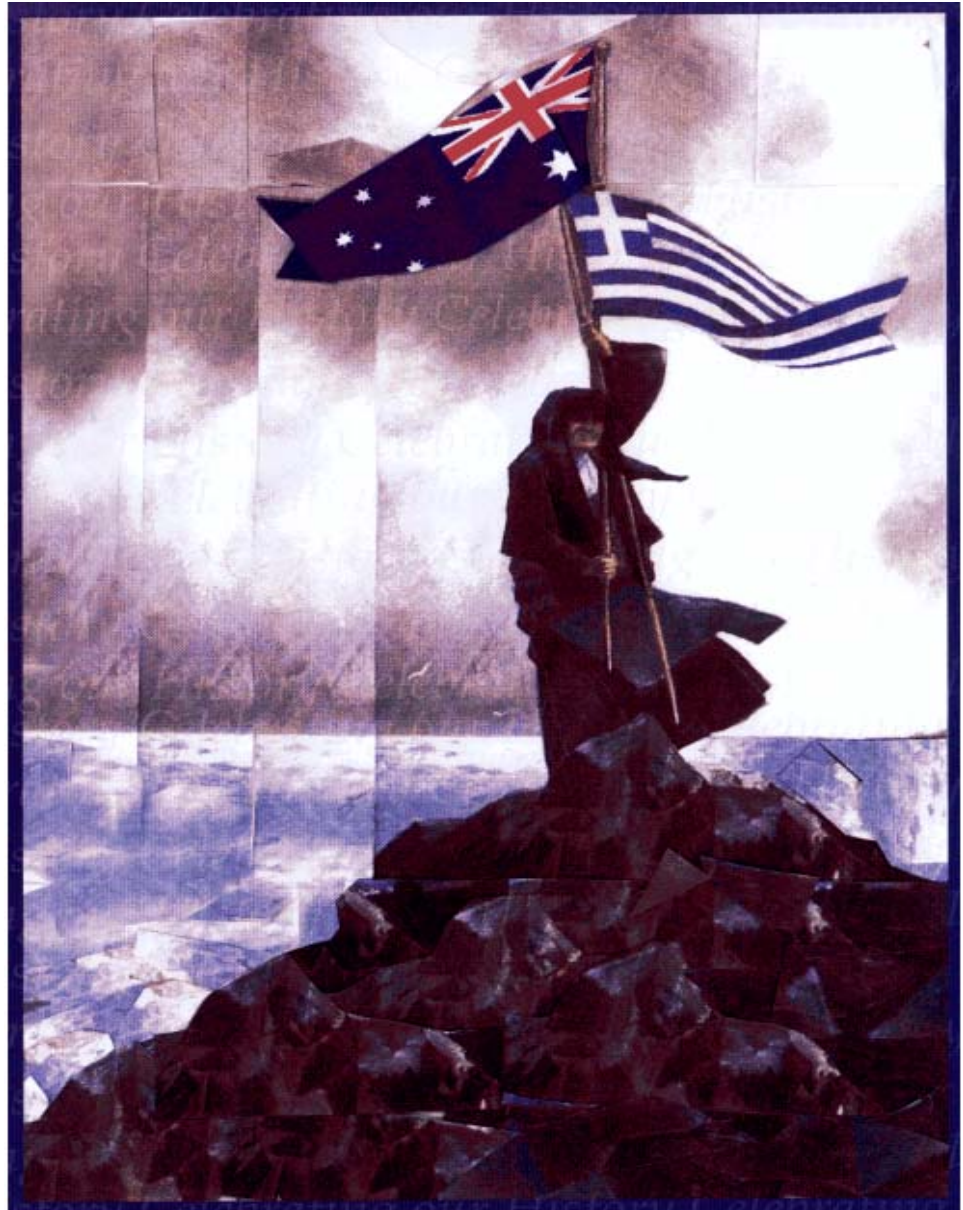
Newsletter #130 April 2007