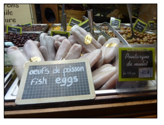
Poutargue or Avgotaraho displayed in the market in the old town of Nice, France

(Now you know why it is so expensive to buy!)